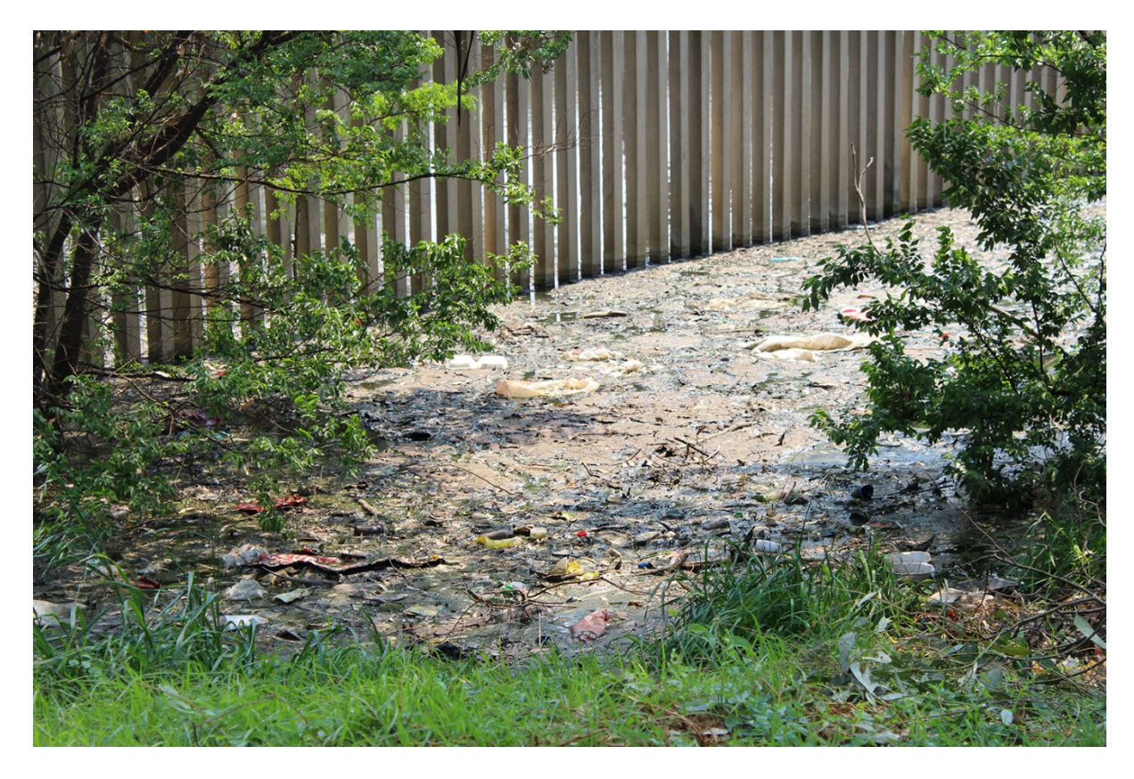
Above: The wastewater pump station in Golf Street, Three Rivers, Vereeniging is flooded with sewage and abandoned.