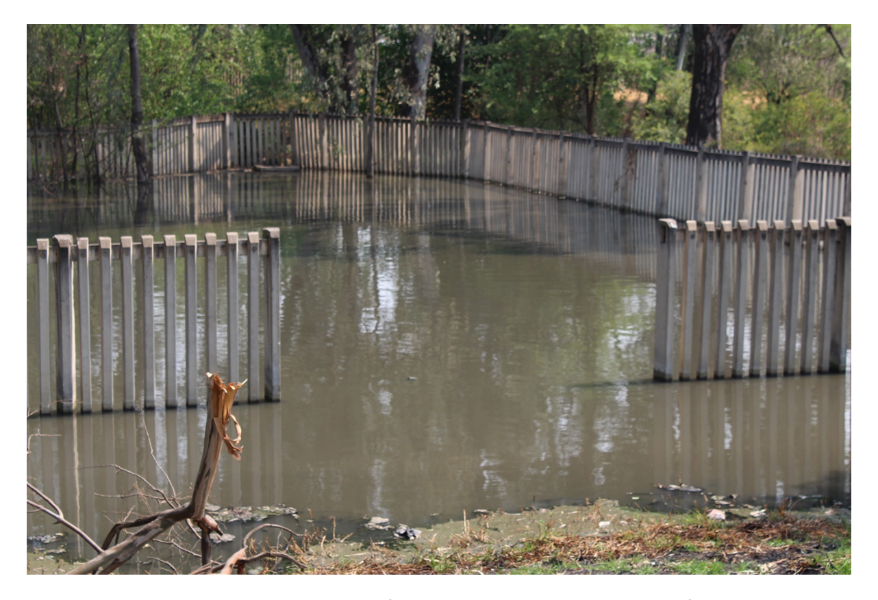
Above: The wastewater pump station in Golf Street, Three Rivers, Vereeniging is flooded with sewage and abandoned.