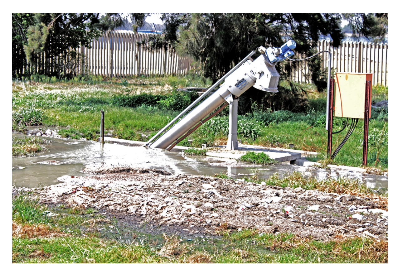
Above: The wastewater pump station in Seeiso Street, Sharpeville, is flooded with sewage, vandalised and abandoned.