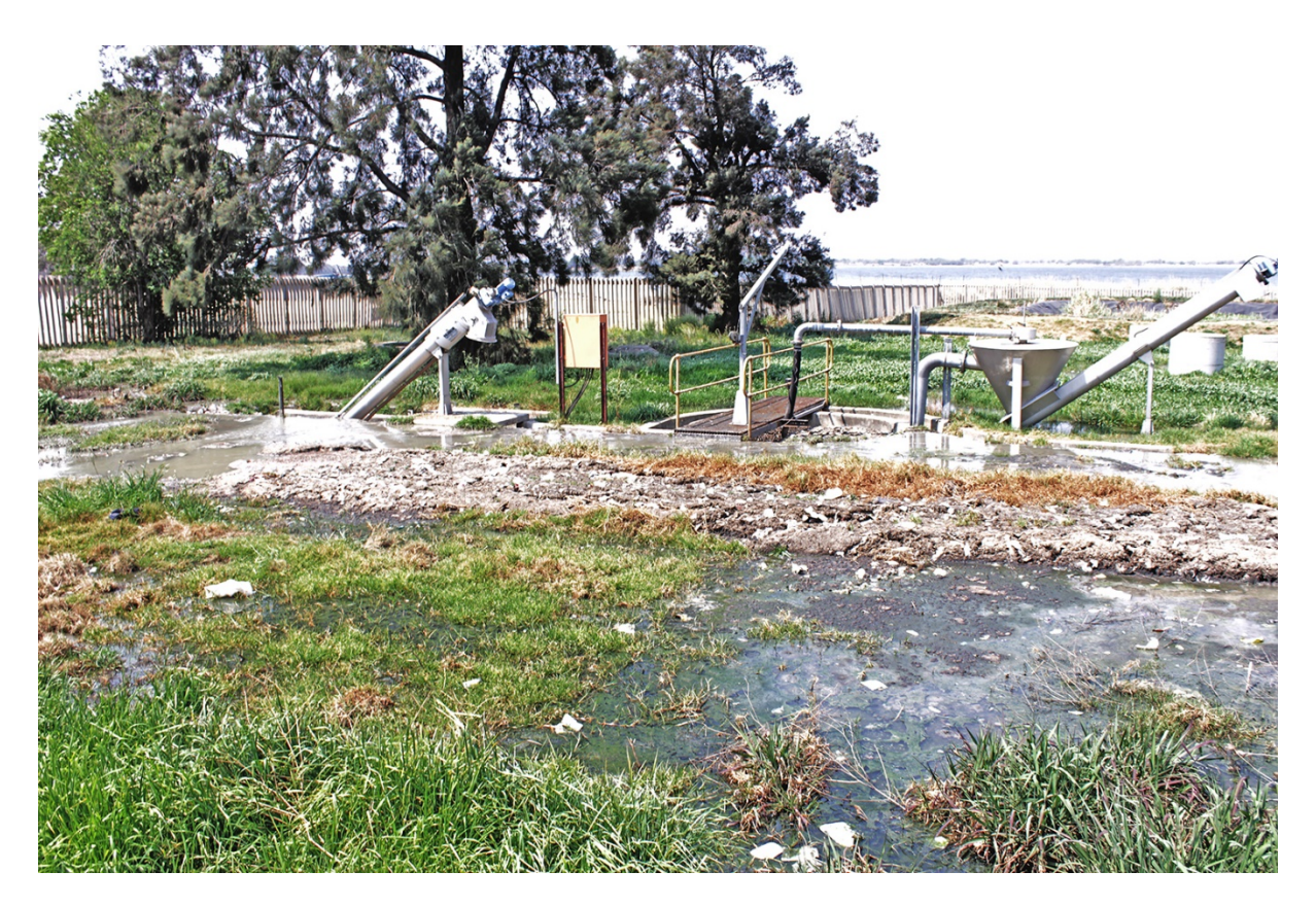
Above: The wastewater pump station in Seeiso Street, Sharpeville, is flooded with sewage, vandalised and abandoned.