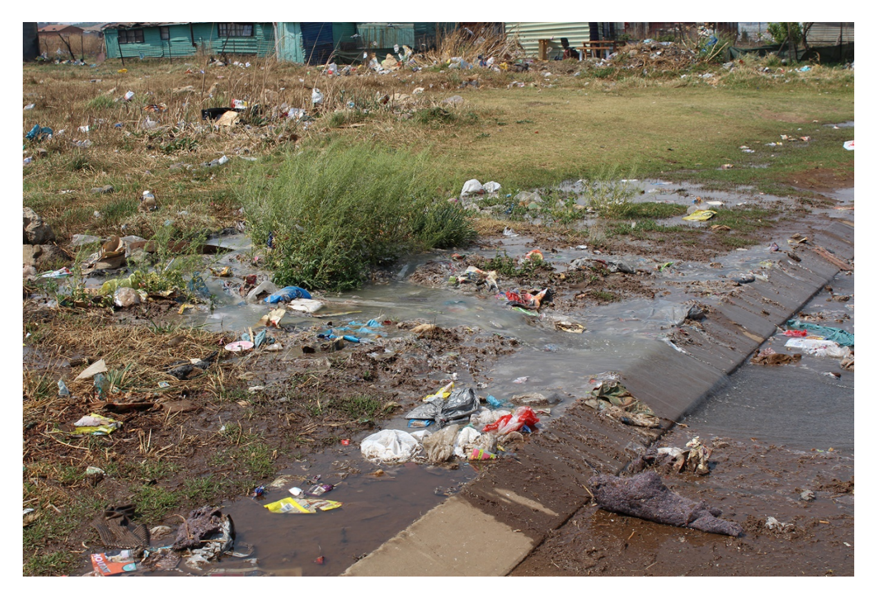
Above: Sewage spill in Mongau Street, Tshepiso, Sharpeville.